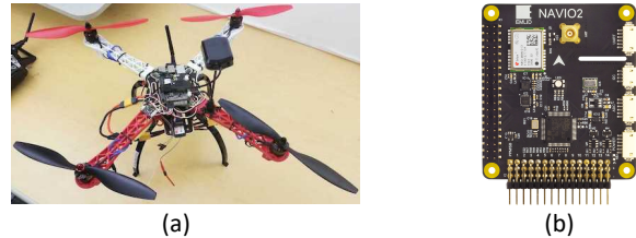
Figure 1: (a) Raspberry-Pi-Based Drone. (b) The Top view of flight controller[4].

The cognitive functions layer consists of the high level and low level APIs which can be used by a developer to write custom code and custom firmware. Then, the custom firmware is converted to a Linux service and run on the Pi in the background while further coding and development occurs with the help of an IDE. To achieve this, we utilized the DroneKit[5] C++ and Python APIs